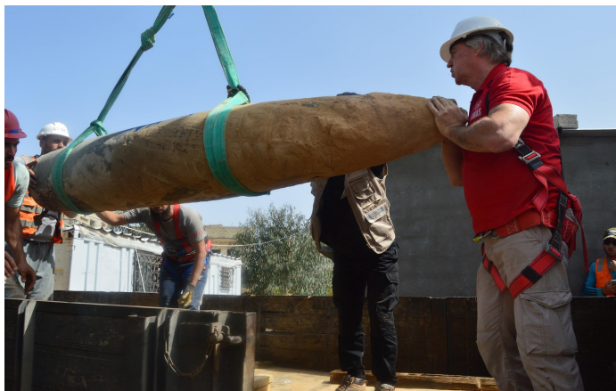
UNMAS Chief of Operations (CoO) managing the movement of a recovered munition onto a truck for disposal, Rafah, Gaza, Palestine, March 2023.

In March 2023, UNMAS worked diligently to excavate a deep buried bomb (DBB) located in a densely populated area in Rafah, in southern Gaza. UNMAS excavated, rendered safe, and witnessed the disposal of the DBB and declared the site safe and clear from any known explosive hazards. People living in the area resumed their normal life with a renewed sense of safety and security.