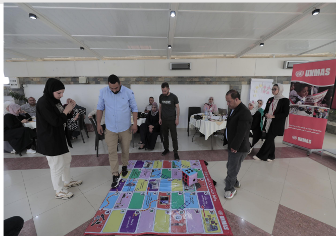
Participants practicing the delivery of children-appropriate EORE using Snakes and Ladders game, as part of the EORE TOT delivered by UNMAS, Gaza, Palestine.

In May 2023, UNMAS Palestine delivered a training of trainers (TOT) for UNICEF's implementing partners' personnel from the Tamer Institute for Community Education and Ma'an Development Center, in Gaza. A total of 50 participants were equipped with knowledge and skills to deliver quality age and gender-appropriate EORE as they engage with the beneficiaries of their humanitarian and development projects. UNMAS will continue the engagement with like-minded stakeholders to ensure knowledge sharing and continued delivery of EORE to at-risk communities.