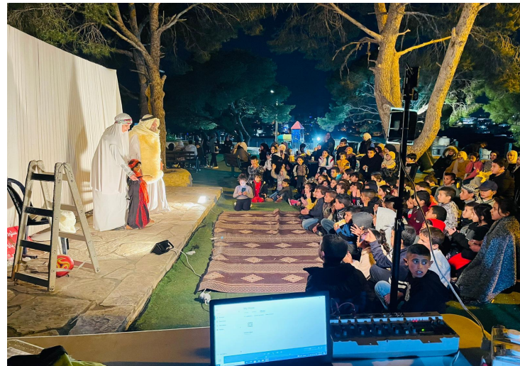
UNMAS delivered EORE to children through puppet shows in Al-Eizariya, East Jerusalem, April 2023.

In March 2023, UNMAS rolled-out a mobile puppet shows in the West Bank to educate children on the threat of explosive ordnance. The puppet shows included storytelling, plays, and interactive audience participation to provide EORE messages in a child-friendly manner. The shows continued throughout various governorates and neighborhoods such as Hebron, Al-Khan Al-Ahmar, and Bedouin communities living in proximity to military training sites, etc. A total of 14 shows have been performed, targeting a total of 1,264 children, including 576 girls and 688 boys, in addition to more than 200 parents. The shows were made accessible to children with disabilities so they could receive EORE with their friends and family members.