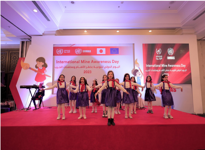
UNRWA school children dancing during Safe Steps song at the IMAD event, March 2023, Gaza, Palestine.